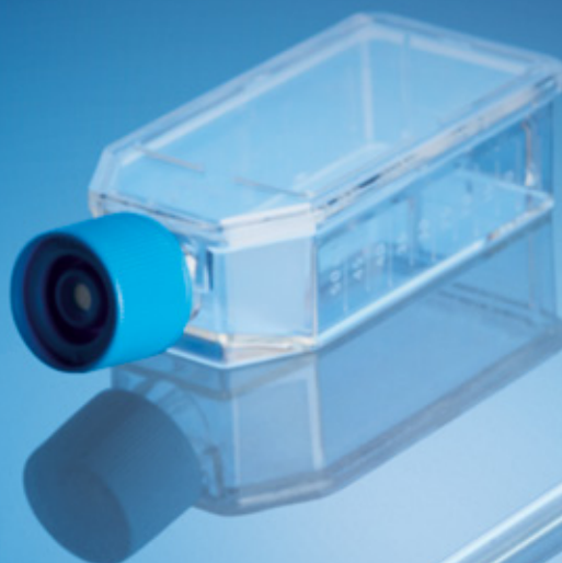
CELL CULTURE FLASK (optional)