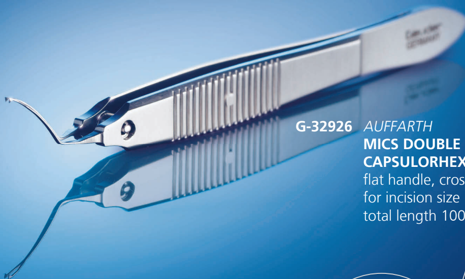
G-32926 AUFFARTH MICS DOUBLE CROSS ACTION CAPSULORHEXIS FORCEPS flat handle, cross-action, for incision size 1.6 mm, total length 100 mm

AUFFARTH MICS DOUBLE CROSS ACTION CAPSULORHEXIS FORCEPS